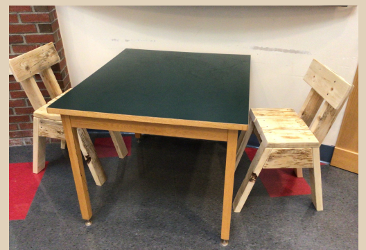
Brand new stackable seats, made by students in the Hatchery Internship Program!

Follow the ESVM Library news as it happens